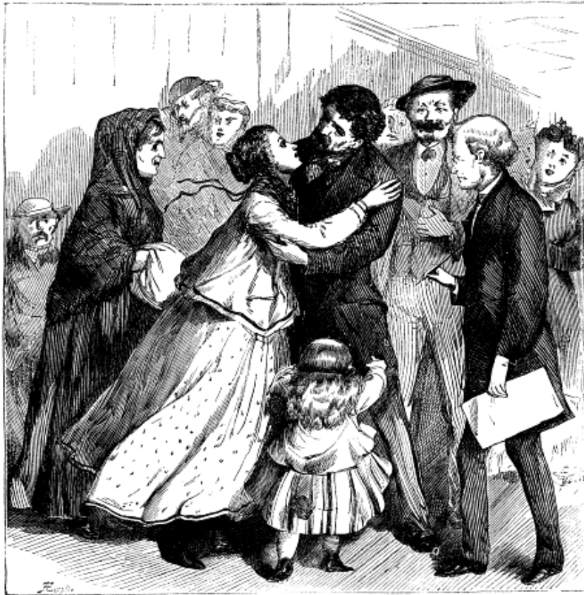
MEETING OF FRIENDS.

the City of Paris , all you have to do is to read the list of arrivals in your paper every morning about the time the steamer is due. When you find that she has arrived, you go down to Castle Garden to this office, to which there is a separate entrance from the Battery, and there you give to the clerk in charge the name of the passenger you are expecting. This will be called out inside in the rotunda, and if she has been on board she will be sent in to you, when there will be any quantity of questions to put and answers to make. It certainly is interesting to witness these meetings, as I did. Here is the name of a comely Irish girl called out, she enters blushing, and is the next moment in the arms of her faithful sweet-heart, who left her home in Ireland three years ago, and has now sent for her to make her his bride. There is kissing and crying and squeezing, and applause from the by-standers, who for the moment forget that they themselves in a few minutes will probably do the same sort of thing. That is a new version of "Pat Malloy," and, I think, the right one. Father and son, sister and brother, meet here in fond embraces, with tears of joy, after years