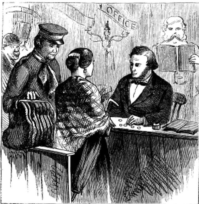
EXCHANGE BROKER'S OFFICE.

way Agency is under strict control of the Commissioners of Emigration, and is held responsible to the purchaser of a ticket for any mistake that may occur. It will be readily understood that but few outside ticket offices, not so controlled, care about exercising the same care and vigilance in forwarding a passenger; they only want his purchase of a ticket and departure out of the way; if he arrives at his destination he is lucky, unless it is some such point as Chicago, or of similar importance, where mistakes can not easily take place. And if he gets a couple of hundred miles out of the way, what does it matter? he paid down his money, and is too far away and too unsophisticated to complain!