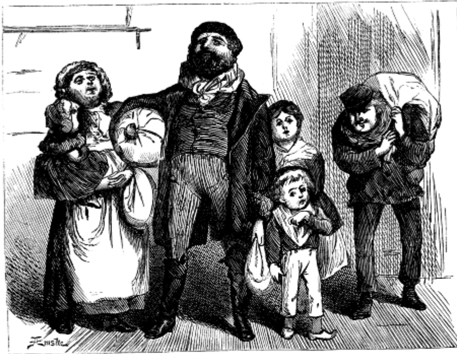
“DAS MUSS DER PALAST SEIN.”

IN the lower part of Broadway, on our way down to the Battery, we met groups of immigrants, newly landed, walking slowly along on the sidewalk, and bestowing a look of wonder on every thing they saw. Trinity Church and the new magnificent “Equitable Building” on the corner of Cedar Street seemed to be special objects of attention. In passing I heard a German woman say of the latter building, “Das muss der Palast sein,” an opinion that seemed to be instantly shared by her companions. For a city without a “Palast” of some kind or other is an impossibility in Germany.