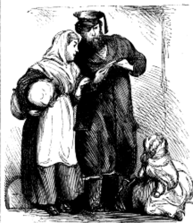
READING LETTERS FROM FRIENDS.

Having got his money changed and his rail-